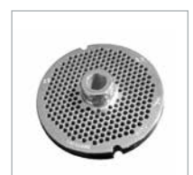
Plate Enterprise System