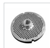
Plate Enterprise System